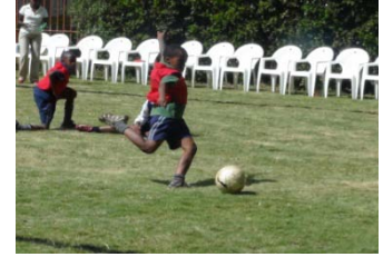
Boys in full flight

Potterhouse Swimming Gala: The Gala has been postponed to 25 th Feb 2012. The swim team has been informed. Let's prepare for the 4 th Feb Skills Gala at MLC and the Swim Africa invitational Gala on the 11 th Feb 2012 at S.O.N.