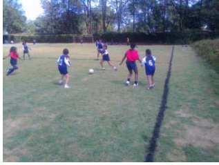
The girls had a good run

won the girls match by 2 to 0. The Boys turned around to stun them with a 2 nil win.